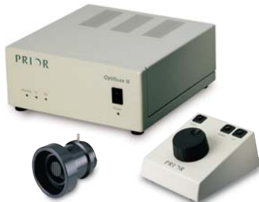
1 Axis system

Applications involving microscope automation are many and varied. OptiScan II was designed with this in mind and the result is the most flexible system commercially available. OptiScan II components can be configured in many different ways meaning that systems can be tailored to match your exact requirements. If your needs change you can rest assured that OptiScan II offers a simple path to future upgrades.