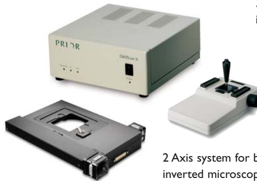
2 Axis system for both upright and inverted microscopes