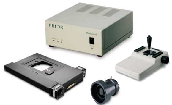
3 Axis system for both upright and inverted microscopes